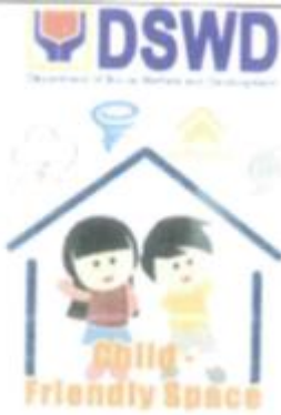
8.5" x 11" all-weather vinyl sticker