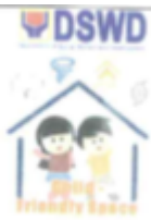
2" x 3.5" (calling card size) all-weather vinyl sticker